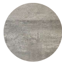
TEMPERED GLASS -21 SANDSTONE 3D PRINTED