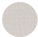
TEXTILENE -51 OFF-WHITE

Please note that the colour codes are indicative.